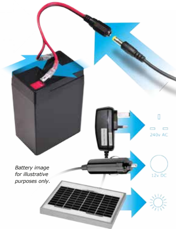
Battery image for illustrative purposes only.