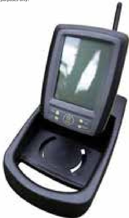
Car Charger image for illustrative purposes only.