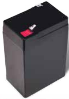
Battery image for illustrative purposes only.