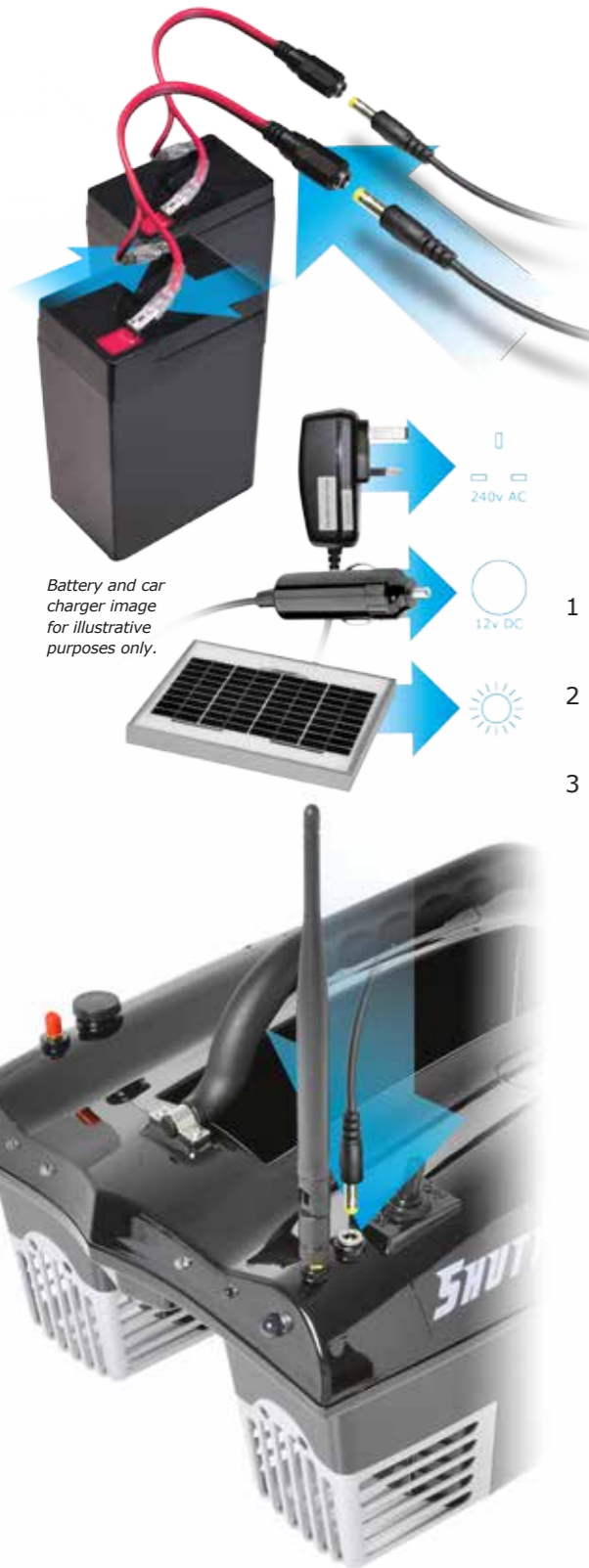
Battery and car charger image for illustrative purposes only.