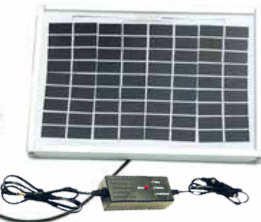
Car Charger image for illustrative purposes only.